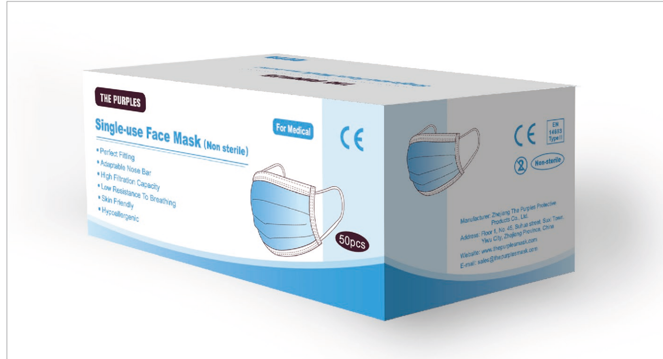
▲ Type II